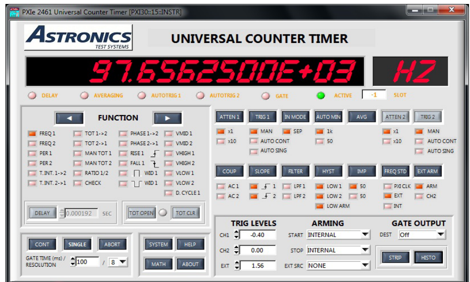
Figure 1: PXIe-2461 Soft Front Panel. Full Control Visible with no Drop-Down Menus Required

Programmable measurement Timeout enables system performance to be optimized where input signals are missing.